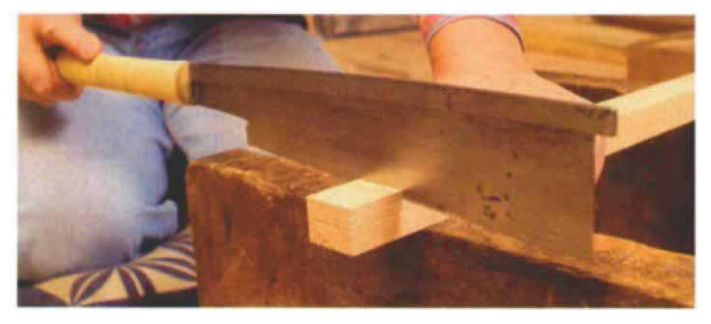
The rigid-backed dozuki-noko makes fine crosscuts with small teeth that leave a very smooth cut surface. It's a good choice for cutting tenon cheeks, as shown here, or for other joinery.