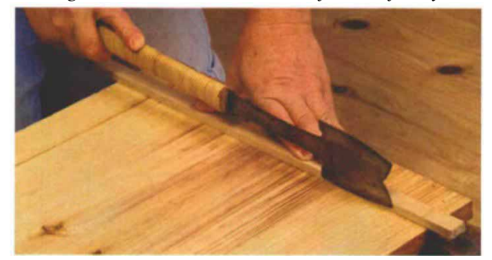
The azebiki-noko can start a cut in the middle of any surface, allowing it to do cutouts or stopped grooves. The author uses a straight stick to guide the saw while cutting the sides of a slot, which will be chiseled out later.